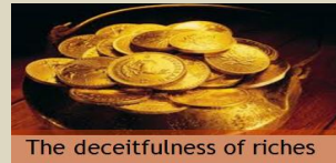
The deceitfulness of riches

The Lord Jesus Christ issued a warning to anyone who is covetous. He said in (Luke 12:15) "Take heed, and beware of covetousness, for a man's life consisteth not in the abundance of the things which he possesses". He continued to speak a parable about a certain rich man who had ground that brought forth plentifully.